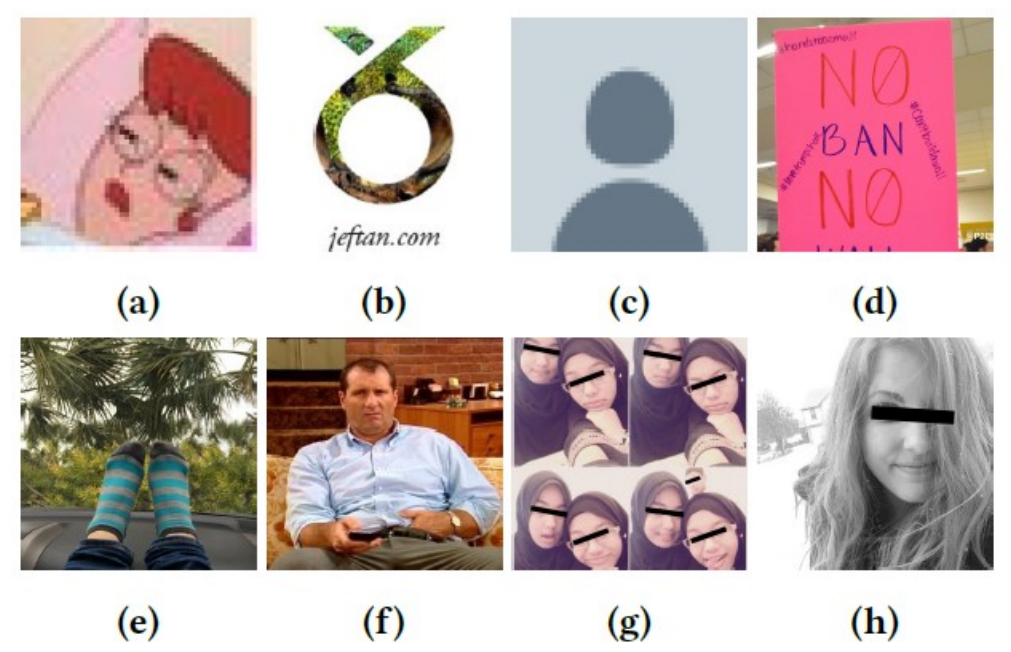
Figure 2 Sample profile pictures of Twitter users. Note: Black bars added for privacy preservation.

In evaluating demographic recognition, we use 6 categorized age bins, like most of the social media analysis tools provide. Those with an age inferred or from ground-truth between 13 to 17 (denoted as 13-17), 18 to 24 (18-24), 25 to 34 (25-34), 35 to 44 (35-44), 45 to 54 (45-54), 55 to 64 (54-64), and 65 or older (65+). Gender is labeled as male or female. For race, Asian, Black, and White comprise the label set, which are three racial labels that Face++ provides.